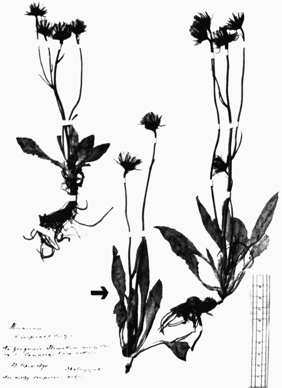
Fig. 1. – Hieracium nigrescens subsp. decipientiforme Włoszczak et Zahn, neotype specimen (herb. W). Original label transcription: “ Hieracium decipiens × Fritzei , Na Gorganiu Ilemskim (między Swicą i Lomnicą) Karp. wschodnie., 27. lipca 1890, Włoszczak” [Mt. Gorgan Ilemski (between the Swica and Lomnica rivers), the East Carpathians, 27 July, 1890, Włoszczak]