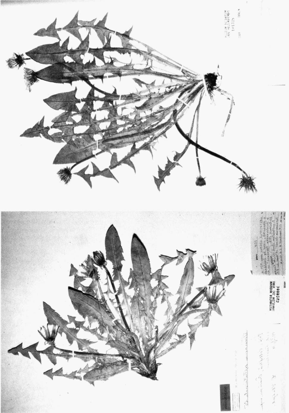
Fig. 2. – Top: Taraxacum campylodes (sect. Taraxacum ); holotype. Bottom: T. guttulatum (sect. Borea ); lectotype.