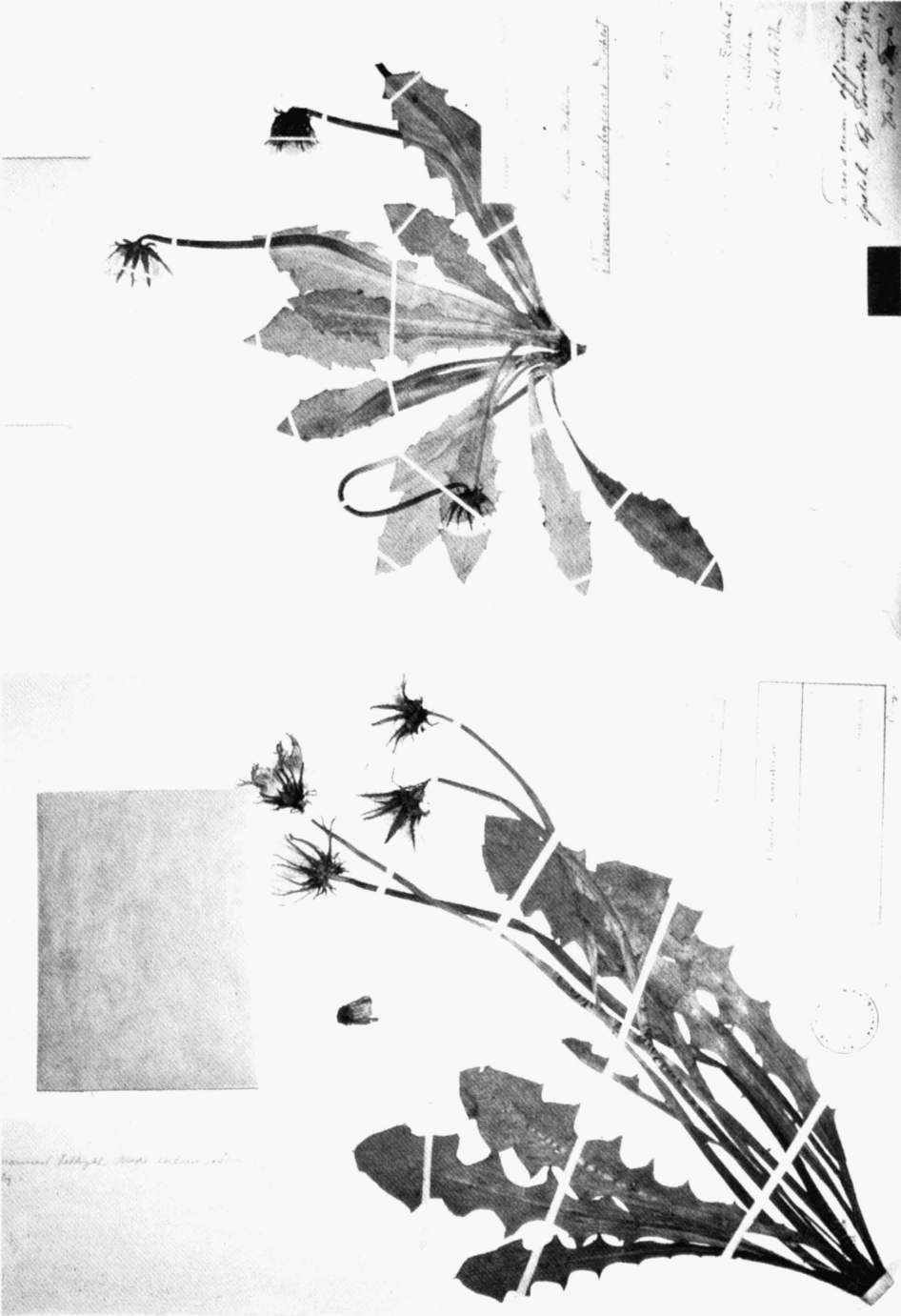
Fig. 1. — Top: Taraxacum brachyceras (sect. Borealia ); lectotype. Bottom: T. brachylobum (sect. Nevosa ); authentic material.