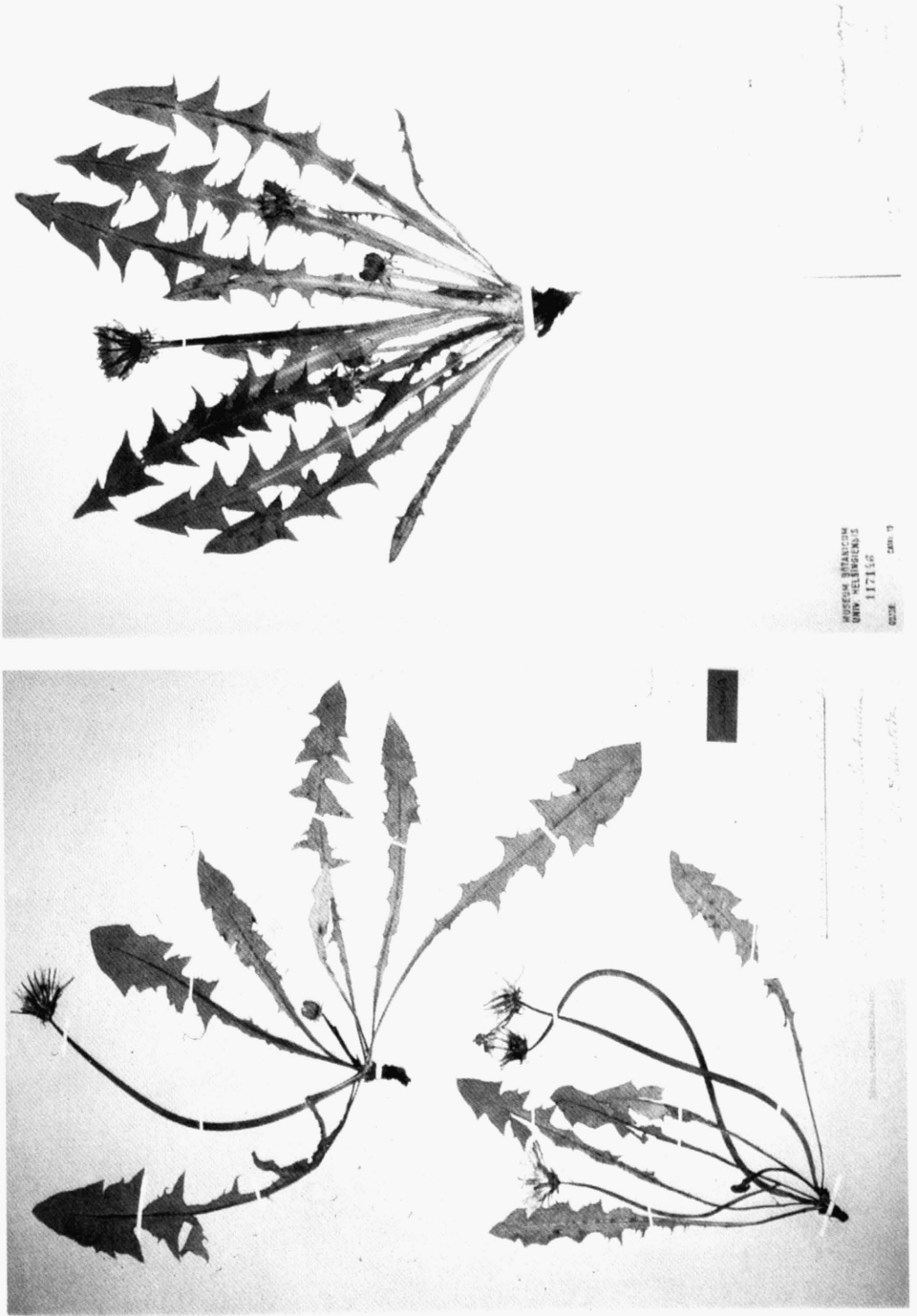
Fig. 3. – Top: Taraxacum septentrionale (sect. Borea ); isolectotype. Bottom: T. spectabile (sect. Spectabilia ); lectotype.