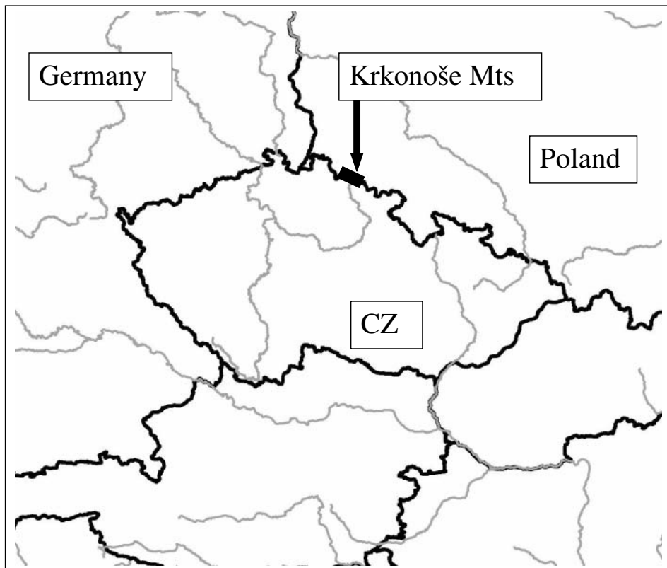
Fig. 1. – Location of the study area.