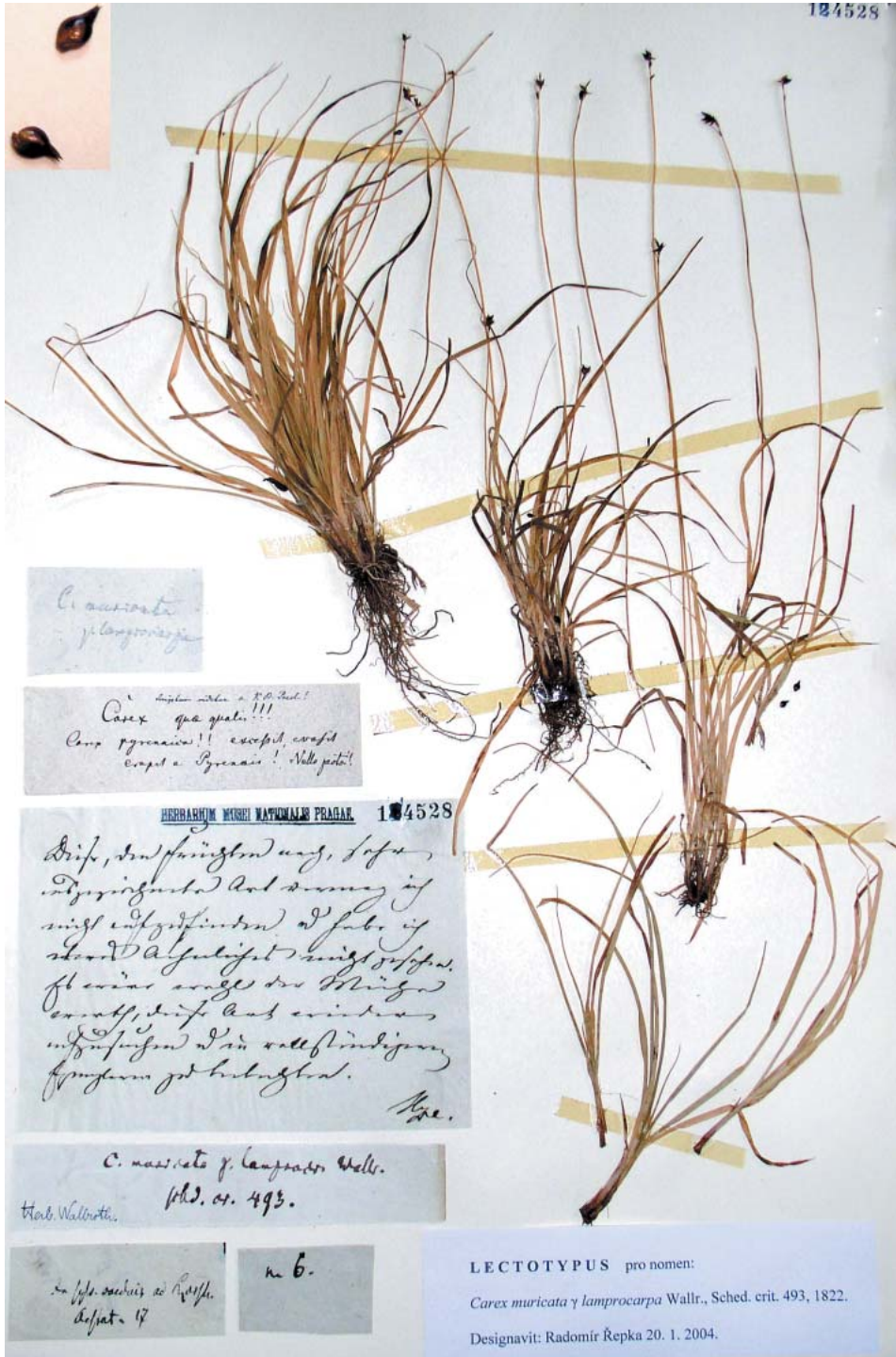
Fig. 1. – Lectotype of Carex muricata var. lamprocarpa (PR 124528)