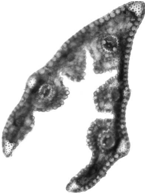
Fig. 2. – Cross-section of the leaf of the hybrid plant.