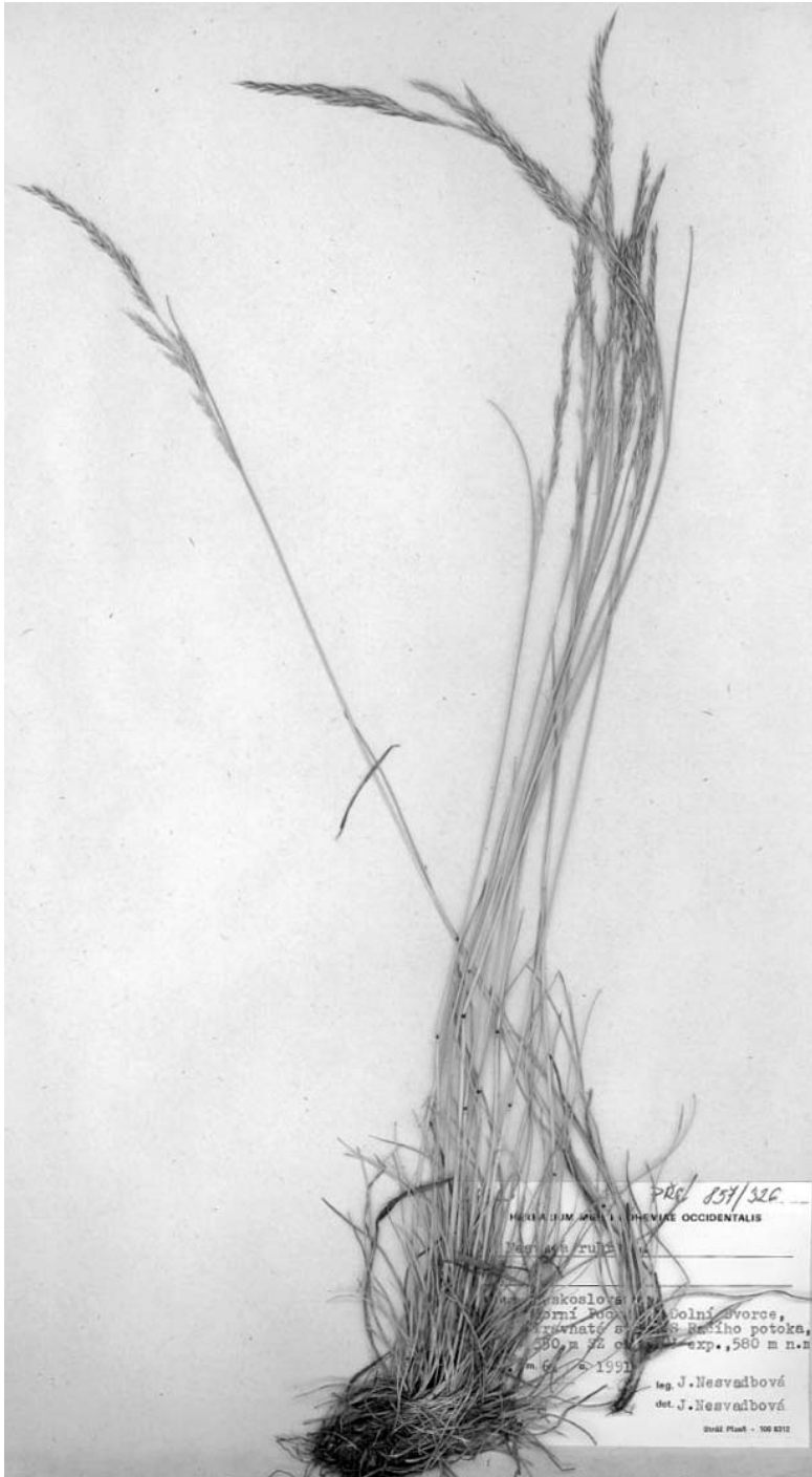
Fig. 1. – General view of the hybrid Festuca rubra × Vulpia myuros .