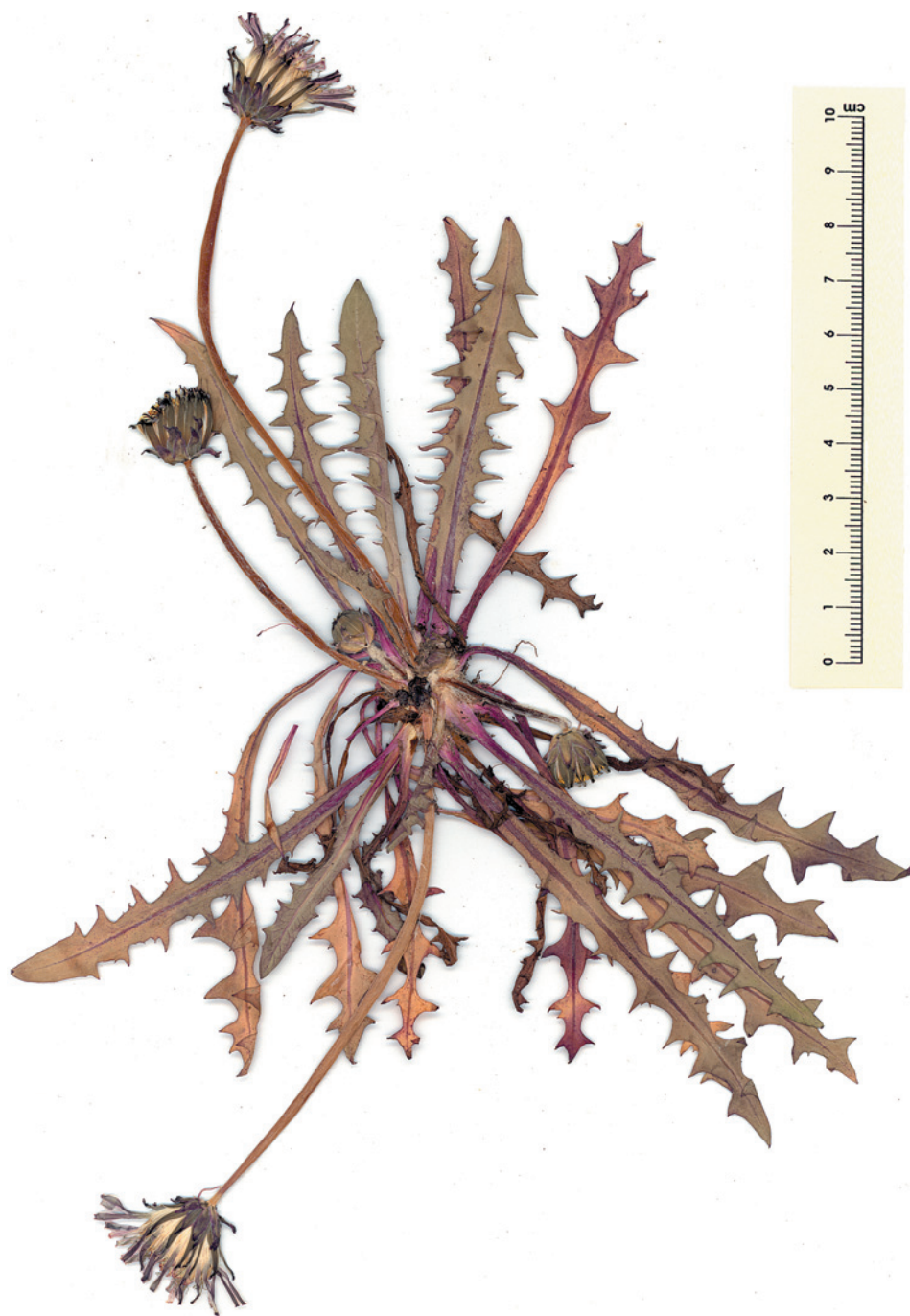
Fig. 2. – Taraxacum mongoliforme Doll (PRA, no. det. 15723).