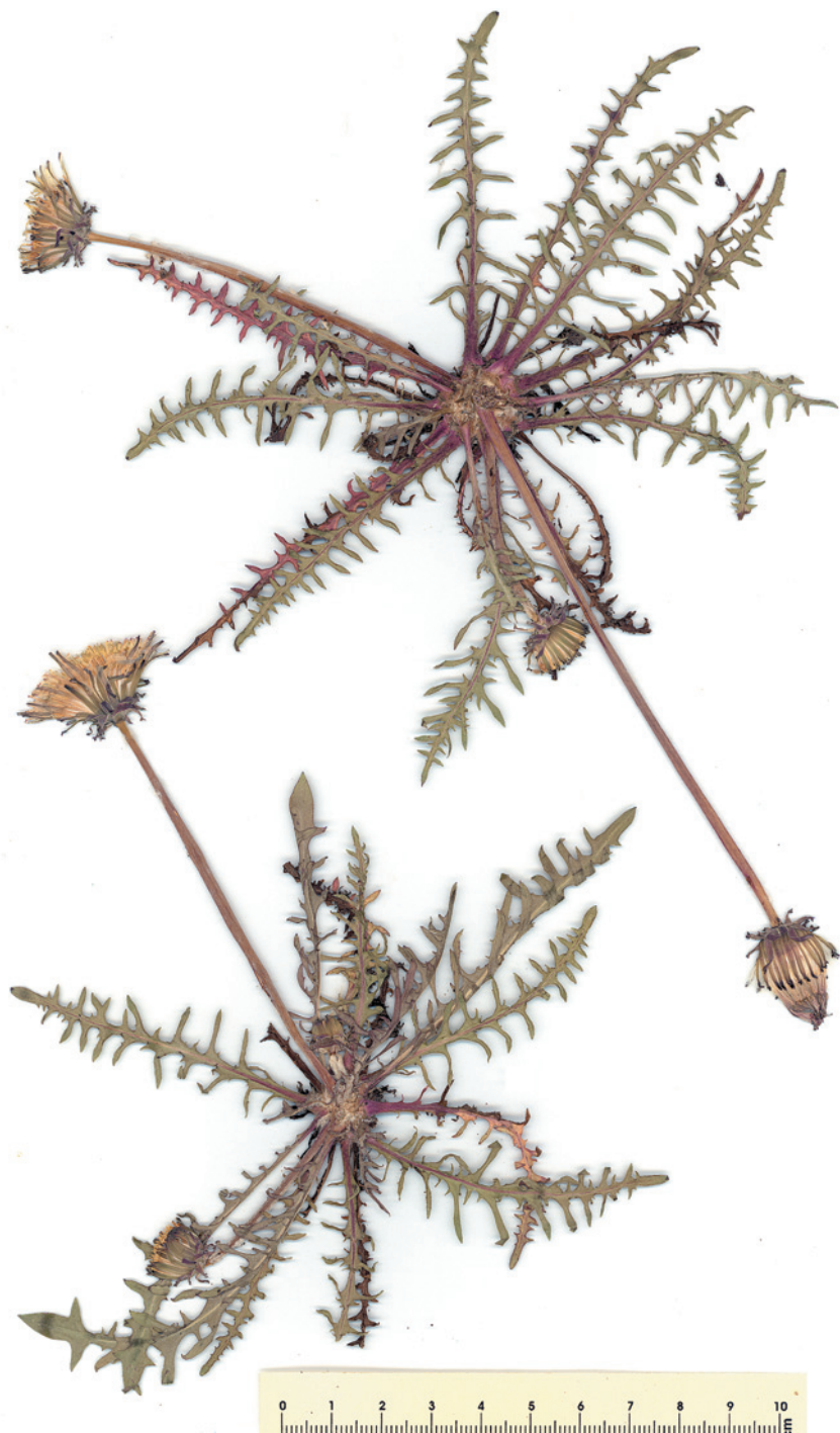
Fig. 6. – Taraxacum abalienatum Kirschner et Štěpánek. Holotype (PRA).