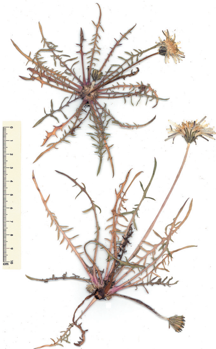
Fig. 7. – Taraxacum odibile Kirschner et Štěpánek (PRA, cultiv. no. JK720).