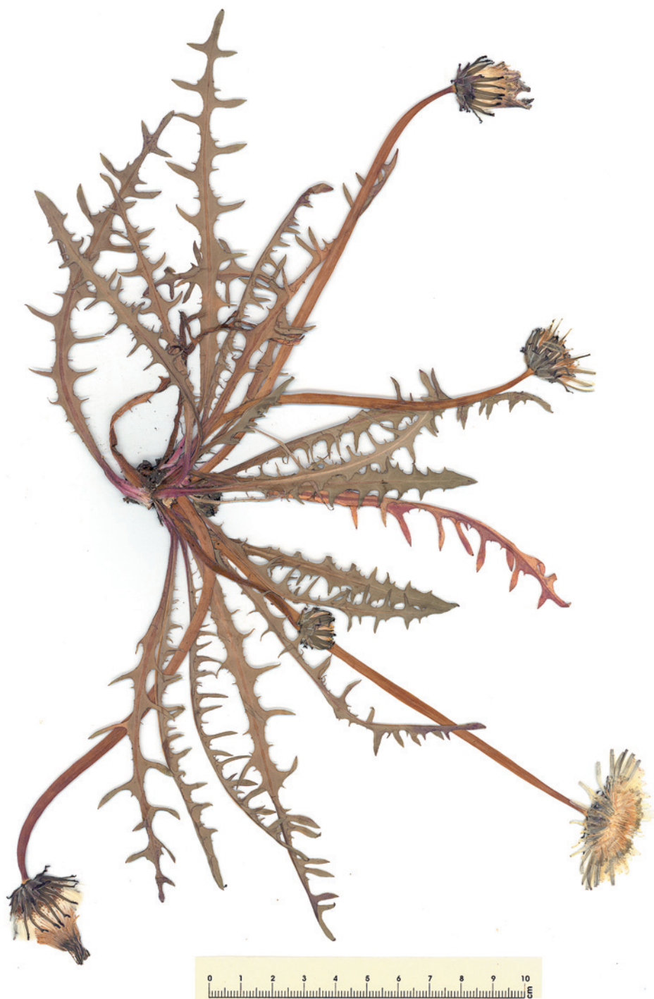
Fig. 5. – Taraxacum abax Kirschner et Štěpánek. Holotype (PRA, no. det. 22713).