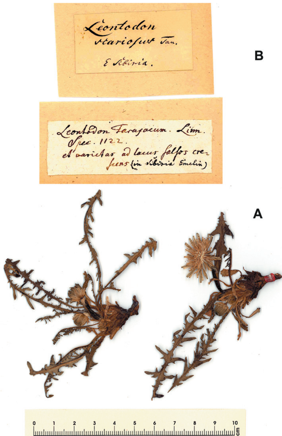
Fig. 3. – Taraxacum scariosum (Tausch) Kirschner et Štěpánek. A, the holotype plants; B, holotype labels (PRC).