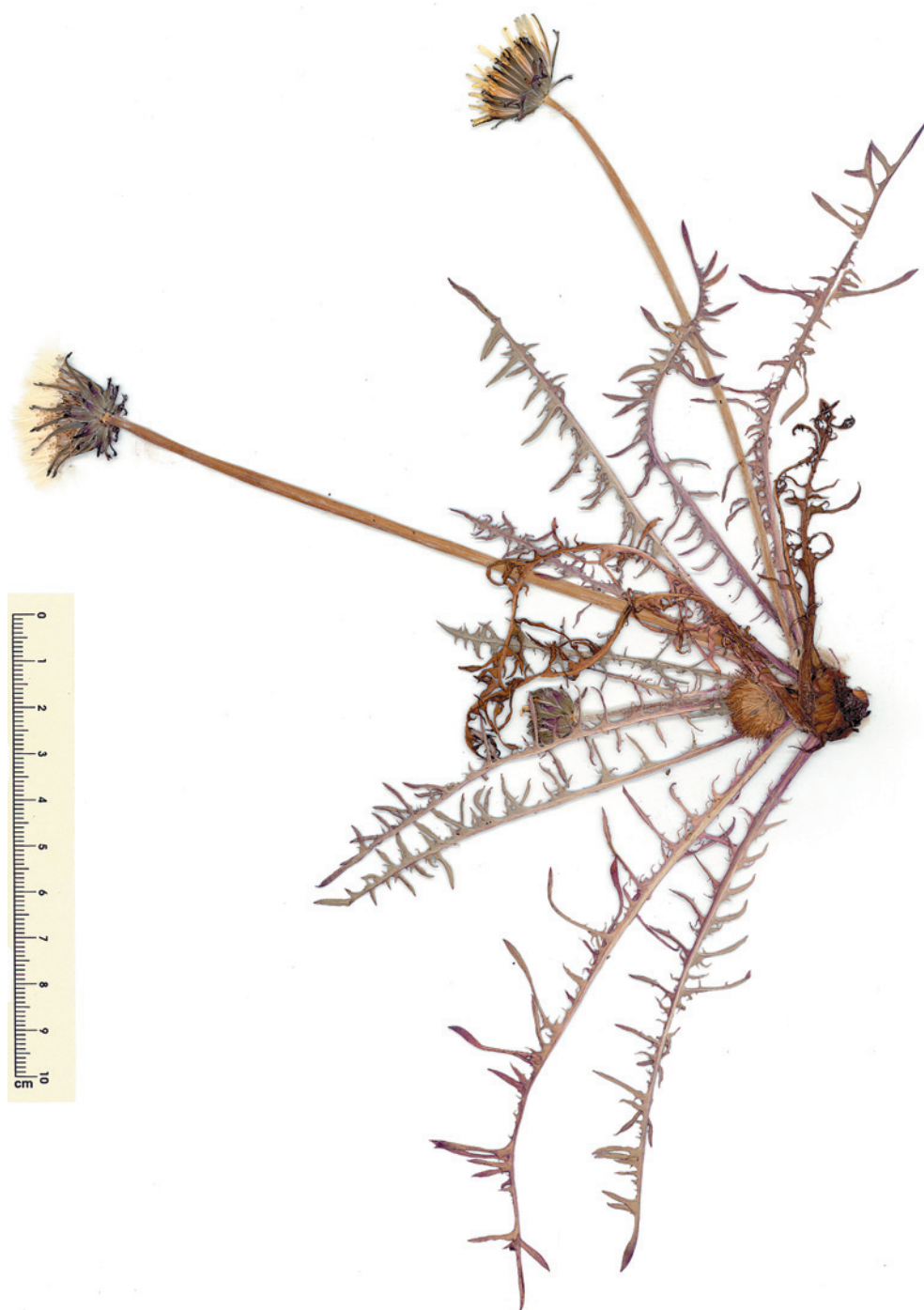
Fig. 4. – Taraxacum scariosum (PRA, no. det. 9932).