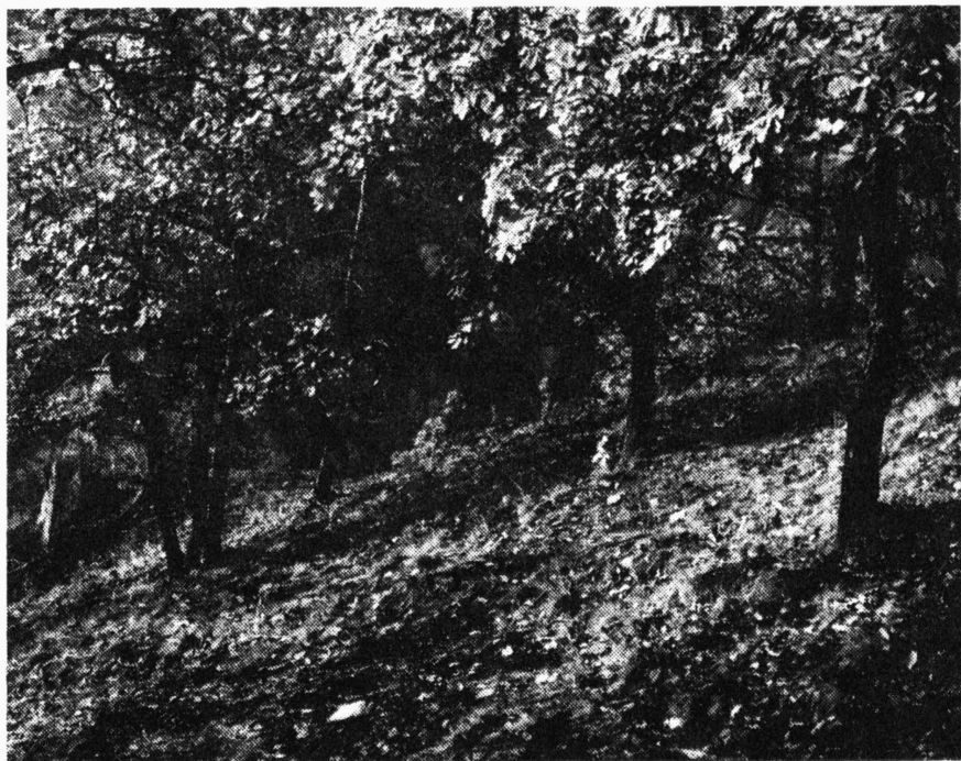
Fig. 4. - The interior of a growth of Genisto pilosae-Quercetum petraeae near the castle of Ketskovice.

1957 and Viscario-Quercetum Stöcker 1965 (or Cytiso-Quercetum sensu Grüneberg et Schlüter 1957 non Pauca 1941) - their surveys were published by e.g. Hartmann et Jahn (1967), Schubert (1972), Neuhäusl et Neuhäuslová (1977). A differential species of the Genisto pilosae-Quercetum petraeae is Genista pilosa (often dominating the herb layer). In some stands of the Cynancho-Quercetum , there is a conspicuous presence of some Carpinion -species. The Viscario-Quercetum is characterized by poorer rocky soils and many thermophilous species are reduced in stands.