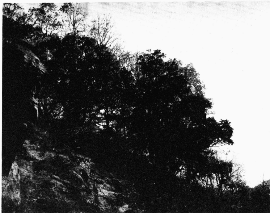
Fig. 3. - Genista pilosae-Quercetum petraeae on slopes below the Ketkovský castle.

- petraeae Br.-Bl. 1932). Accordingly, the acidophilous oak forests with Genista pilosa in the Tríbeč Mountains are not identical with the Genista pilosae-Quercetum petraeae Zólyomi, Jakucs et Fekete ex Soó 1963 (cf. Soó 1971: 164) due to the almost lacking thermophilous species in the stands of the Tríbeč Mts. The absence of these species is not conditioned only phytogeographically (Husová 1967 considers this vegetation a "western edge variant" of the Genista pilosae-Quercetum petraeae with a considerable reduction of the Quercion pubescenti-petraeae -species) but especially by the strongly acid soils, extremely poor nutriments. Hence, it is necessary to separate the oak forests with Genista pilosa in the Tríbeč Mts. from the association Genista pilosae-Quercetum petraeae . Definitive solution of the problem of syntaxonomical position of these communities will be possible only on the basis of a more extensive material comparison.