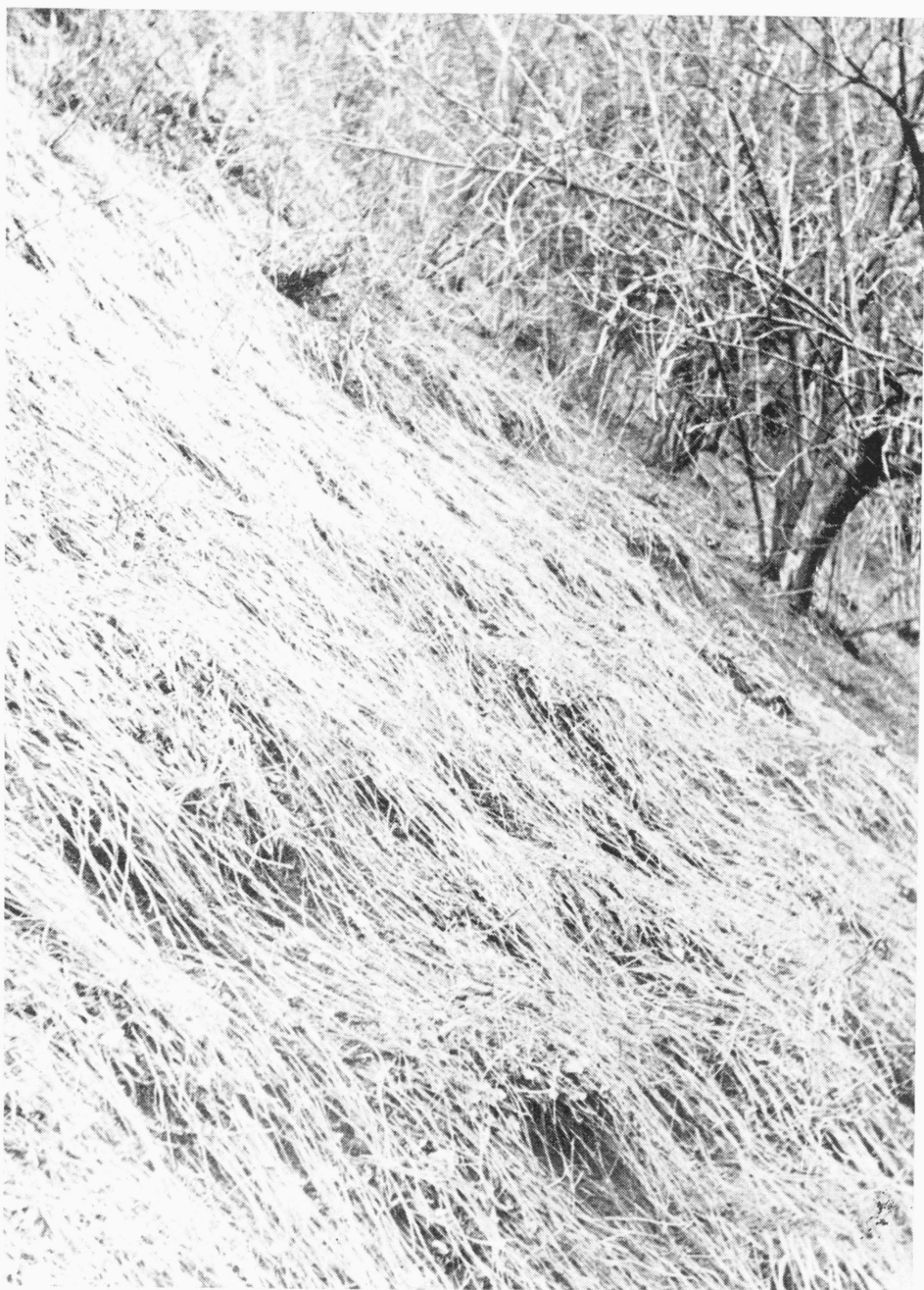
Plate II. — The largest colony of Rubus xanthocarpus at the beginning of a growing season. Dead whitish stems of the last year lying on the slope of the ravine. 16. 4. 1977.