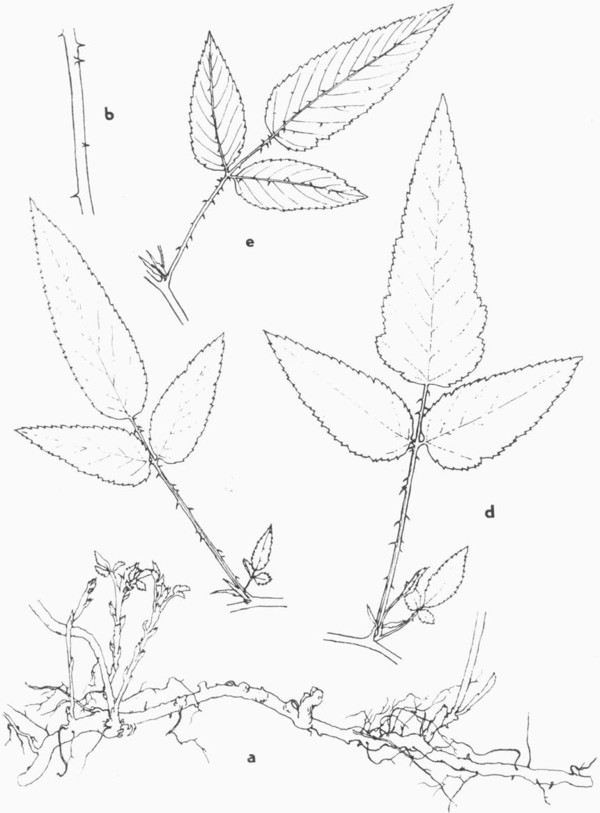
Fig. 1. — Rubus xanthocarpus BUREAU et FRANCH. a — underground portion of the plant with young shoots in early spring; b — stem with prickles; c — typical stem-leaf of mature plant; d — leaf with a terminal leaflet somewhat lobate near the base; e — veins armed with prickles on the underside of a leaflet. Del. Z. Hroudová.

ripe fruit. Petals 10-12 \times 4-6.5 mm, white even in buds, and finely pubescent on both sides, obovate to oblong spatulate, gradually tapering to a short claw (1–2.5 mm long), somewhat exceeding the sepals, entire, spaced at the time of full flowering. Stamens white, a little longer than the greenish styles, numerous, erect; filaments somewhat thick and flattened; anthers