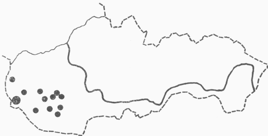
Fig. 2. — Distribution of the association Conyzo-Cynodontetum dactylon in Slovakia (eastern part of Czechoslovakia). Localities of relevés recorded in western Slovakia are designated by black circles.

In Czechoslovakia, the association occurs mainly in south Moravia and south Slovakia. The distribution of Conyzo-Cynodontetum in Slovakia is illustrated in Fig. 2. It was constructed from the data on the distribution of