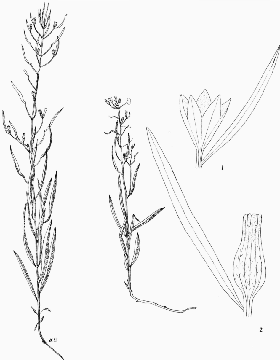
Fig. 3. Habit of Thesium ebracteatum (Del. B. Křísa) and flower (1) and fruit (2).

plici racemosaque, coma bractearum steriliū, statura, rhizomate repenti stolonifero, forma magnitudinequo foliorum.