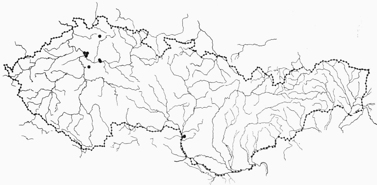
Fig. 2. Habitats of Thesium ebracteatum in Czechoslovakia. (Orig.)