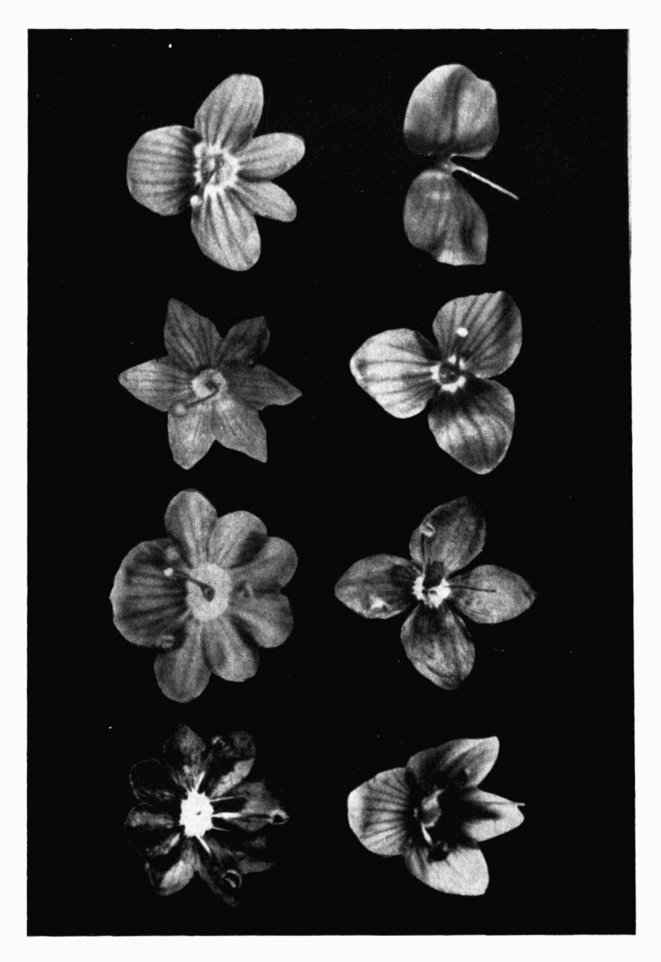
Z. Sladký: Experimental Study of Floral Morphogenesis I. Study of Developmental Possibilities of Floral Primordia in Campanula rapunculoides L. and Veronica austriaca L. subsp. austriaca .