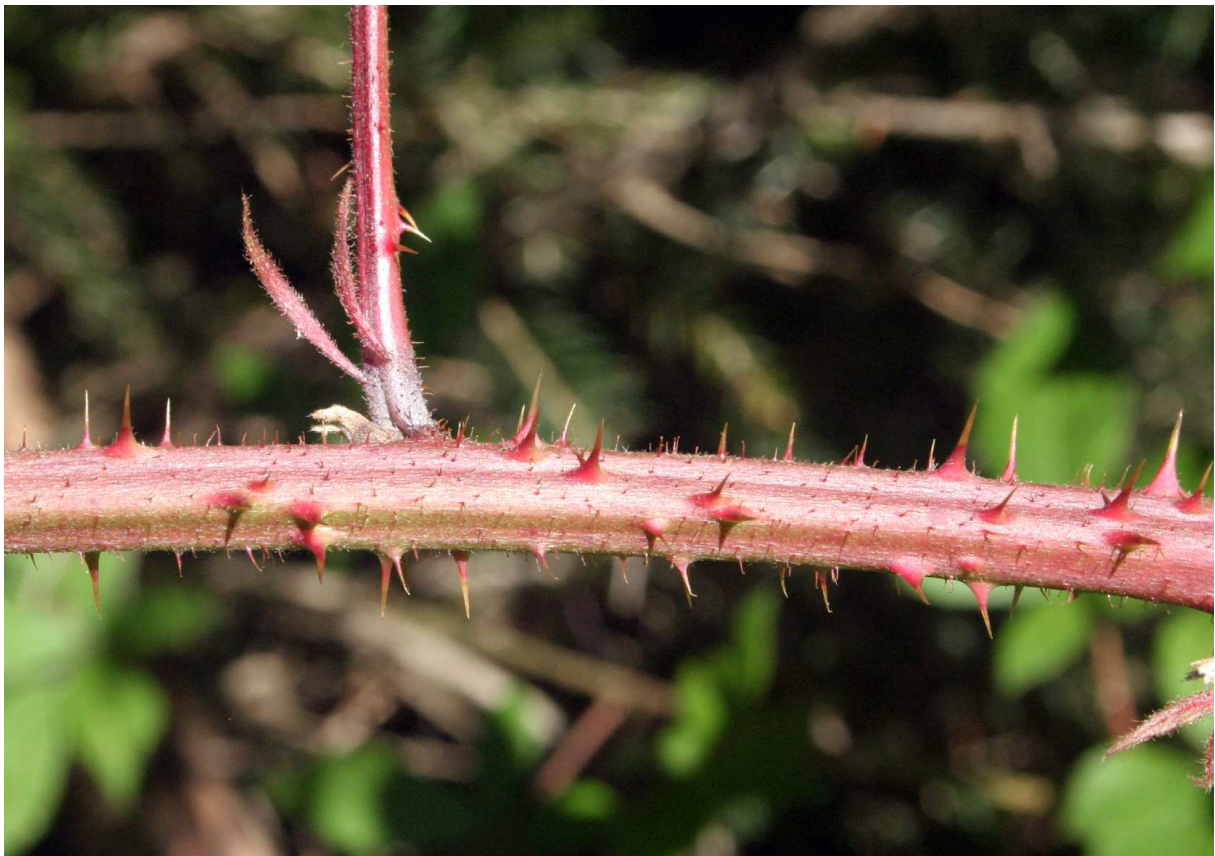
E – detail of mature primocane stem (Czechia, Český Krumlov, Kuklov village, locus classicus, 48°56'08"N, 14°09'59"E, 8 VIII 2017).