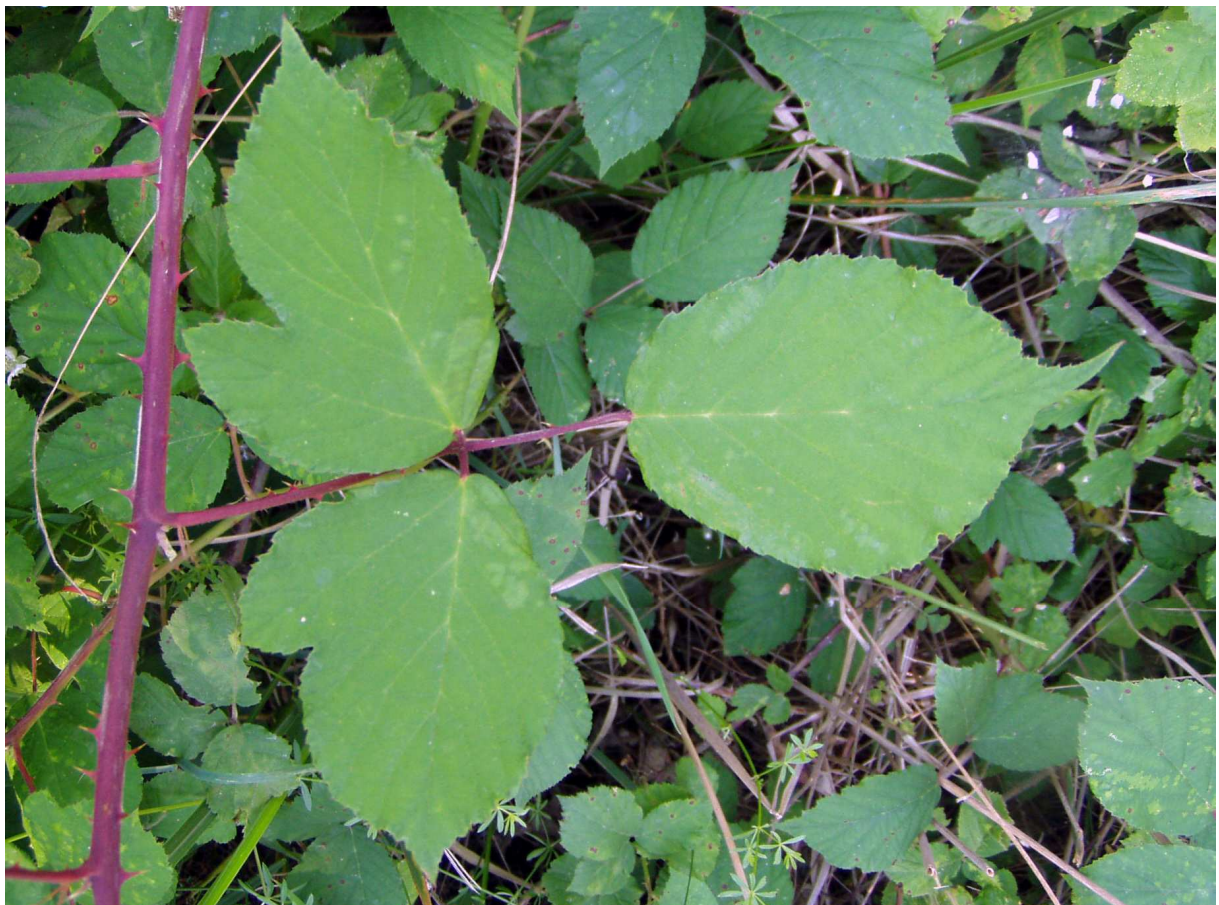
B – 3-foliolate primocane leaf (Czechia, Strakonice town, locus classicus, 49°14'32"N, 13°57'13"E, 9 VII 2010, photo: B. Trávníček).