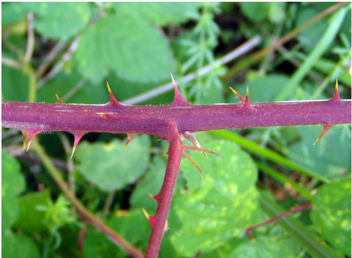
E – detail of mature primocane stem from sunny place (Czechia, Strakonice town, locus classicus, 49°14'32"N, 13°57'13"E, 9 VII 2010).