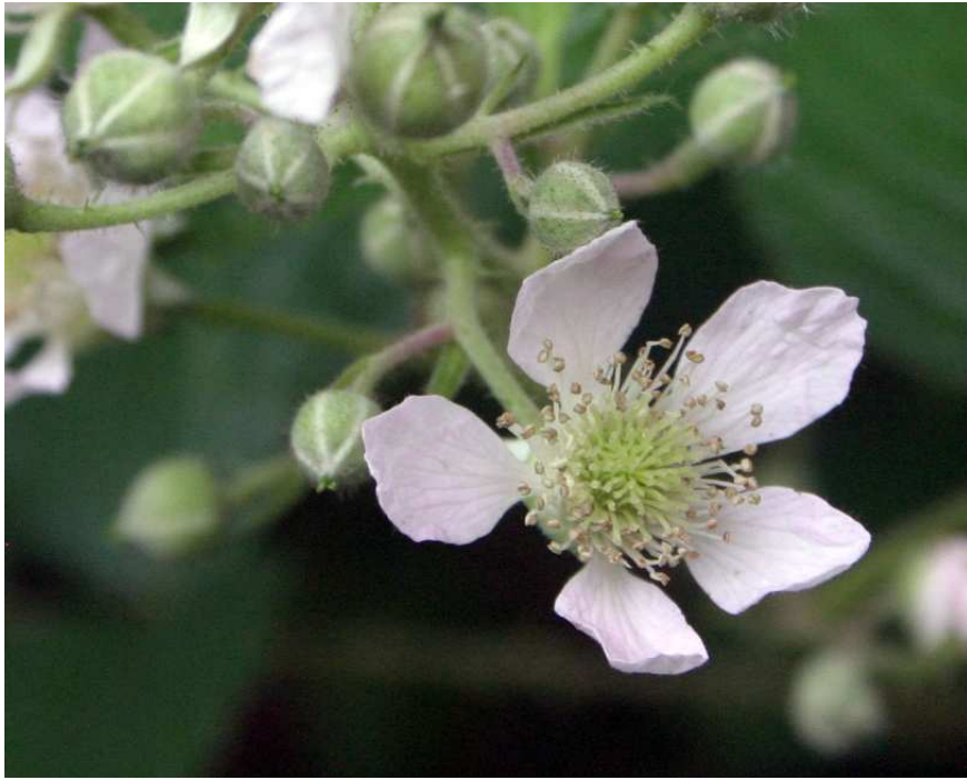
G – detail of flower (Czechia, Prachatice, Klenovice village, 48°59'16"N, 14°06'03"E, 19 VI 2018).