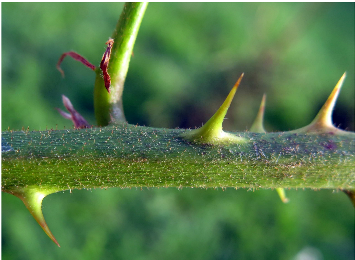
F – detail of mature primocane stem from shady place (Czechia, Strakonice district, Strakonice town, Ryšová hill, 49°16'41"N, 13°53'21"E, 31 VIII 2013).