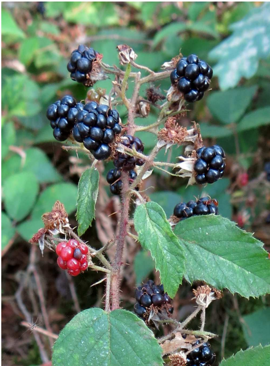
I – detail of infructescence axis (Czechia, Strakonice district, Kladruby village, Divoš hill, 49°16'15"N, 13°45'13"E, 31 VIII 2013, photo: B. Trávníček).