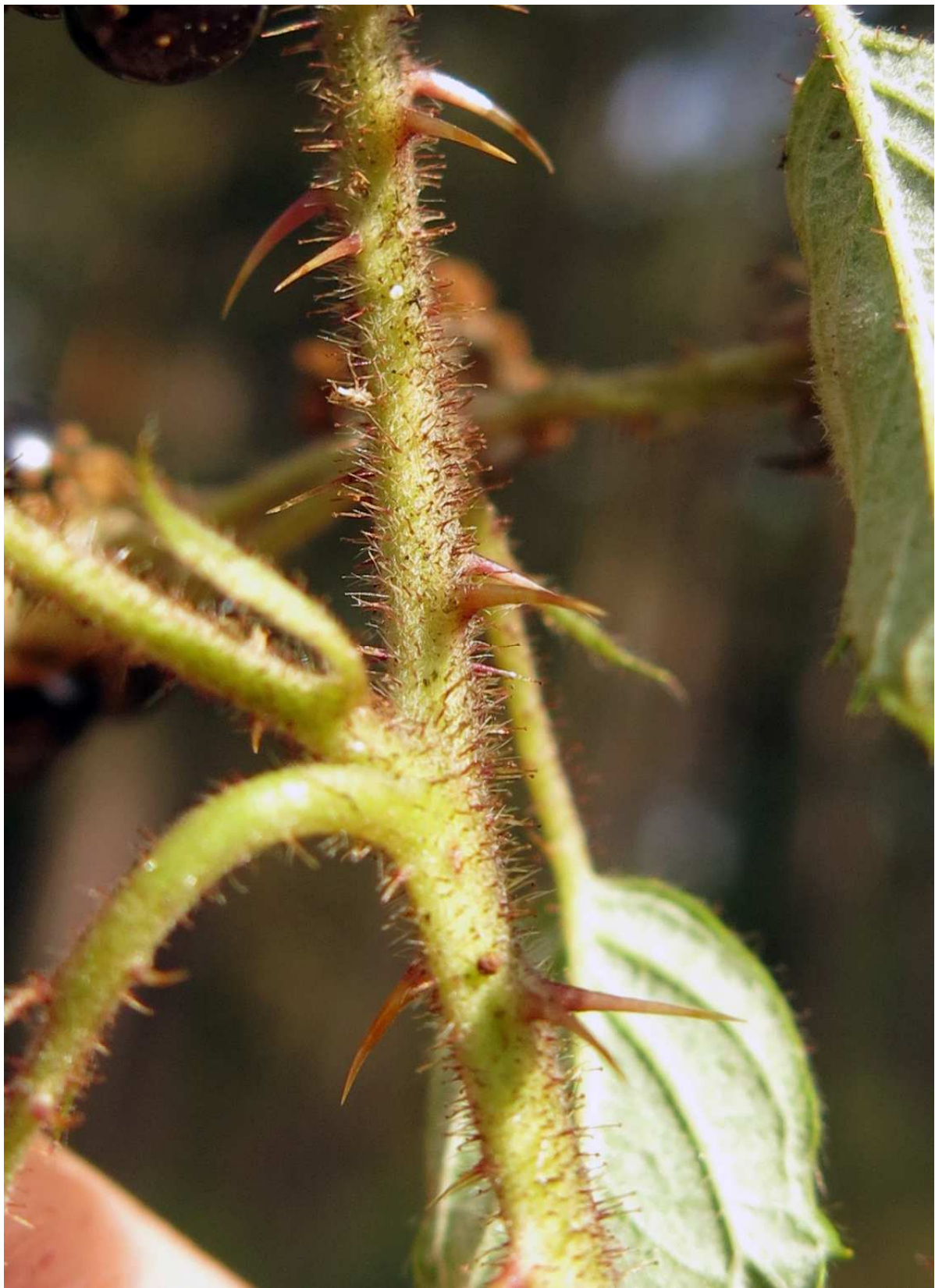
J – detail of collective fruits (Czechia, Strakonice district, Kladruby village, Divoš hill, 49°16'15"N, 13°45'13"E, 31 VIII 2013).