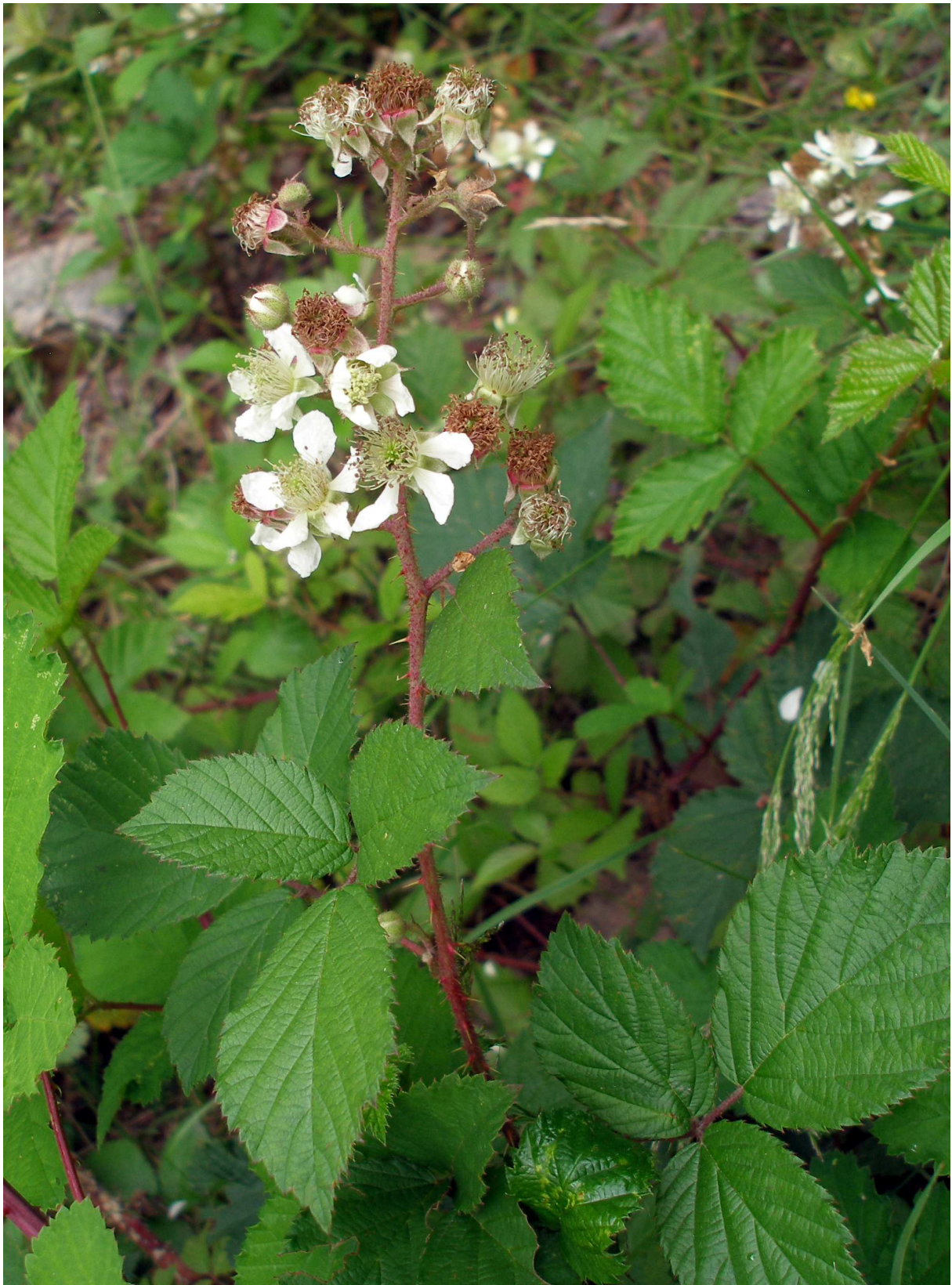
F – inflorescence (Czechia, Český Krumlov, Kuklov village, locus classicus, 48°56'08"N, 14°09'59"E, 14 VII 2009).