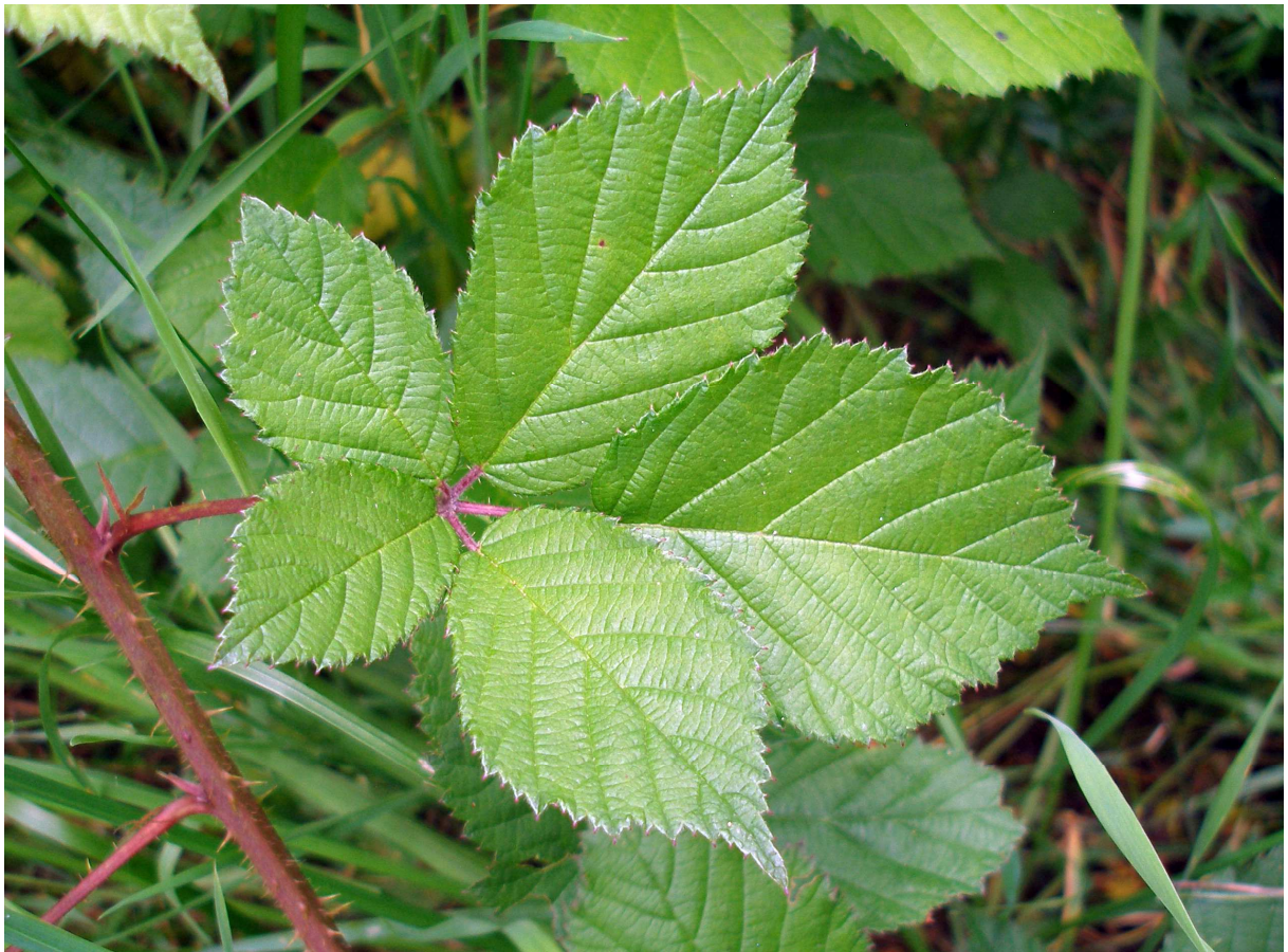
C – primocane leaf at the beginning of the growing season (Czechia, Český Krumlov, Kuklov village, locus classicus, 48°56'08"N, 14°09'59"E, 14 VII 2009).