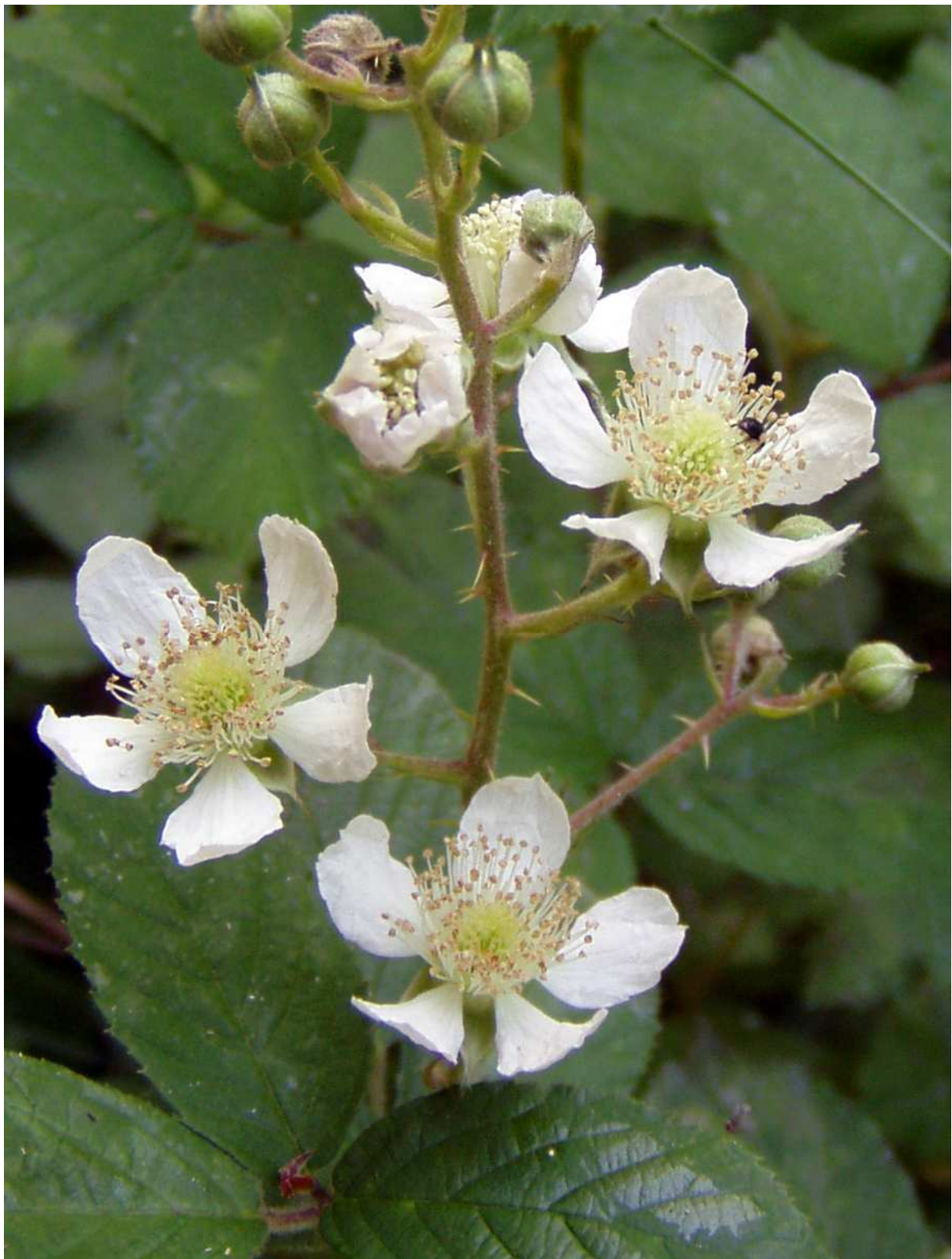
I – detail of flowers (Czechia, Strakonice town, locus classicus, 49°14'32"N, 13°57'13"E, 9 VII 2010).