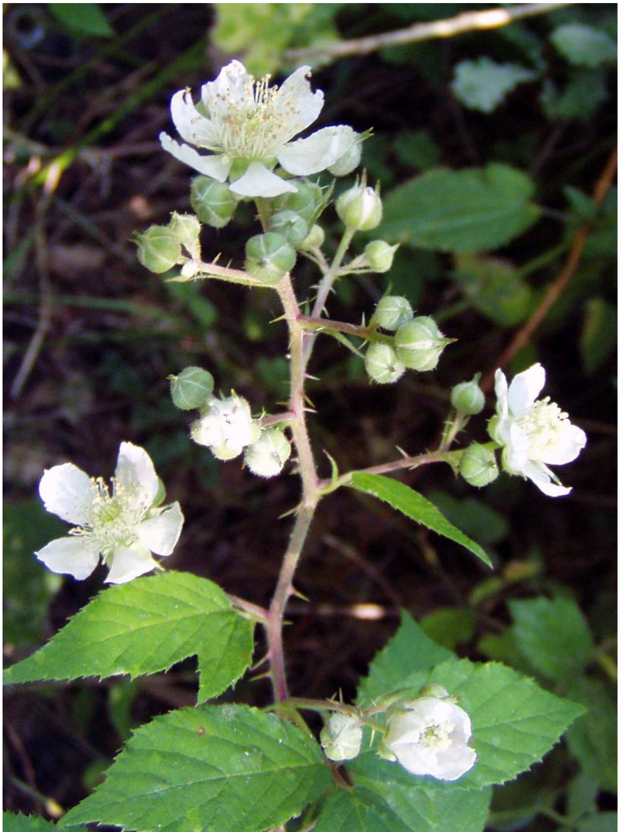
H – upper part of inflorescence (Czechia, Strakonice town, locus classicus, 49°14'32"N, 13°57'13"E, 9 VII 2010).