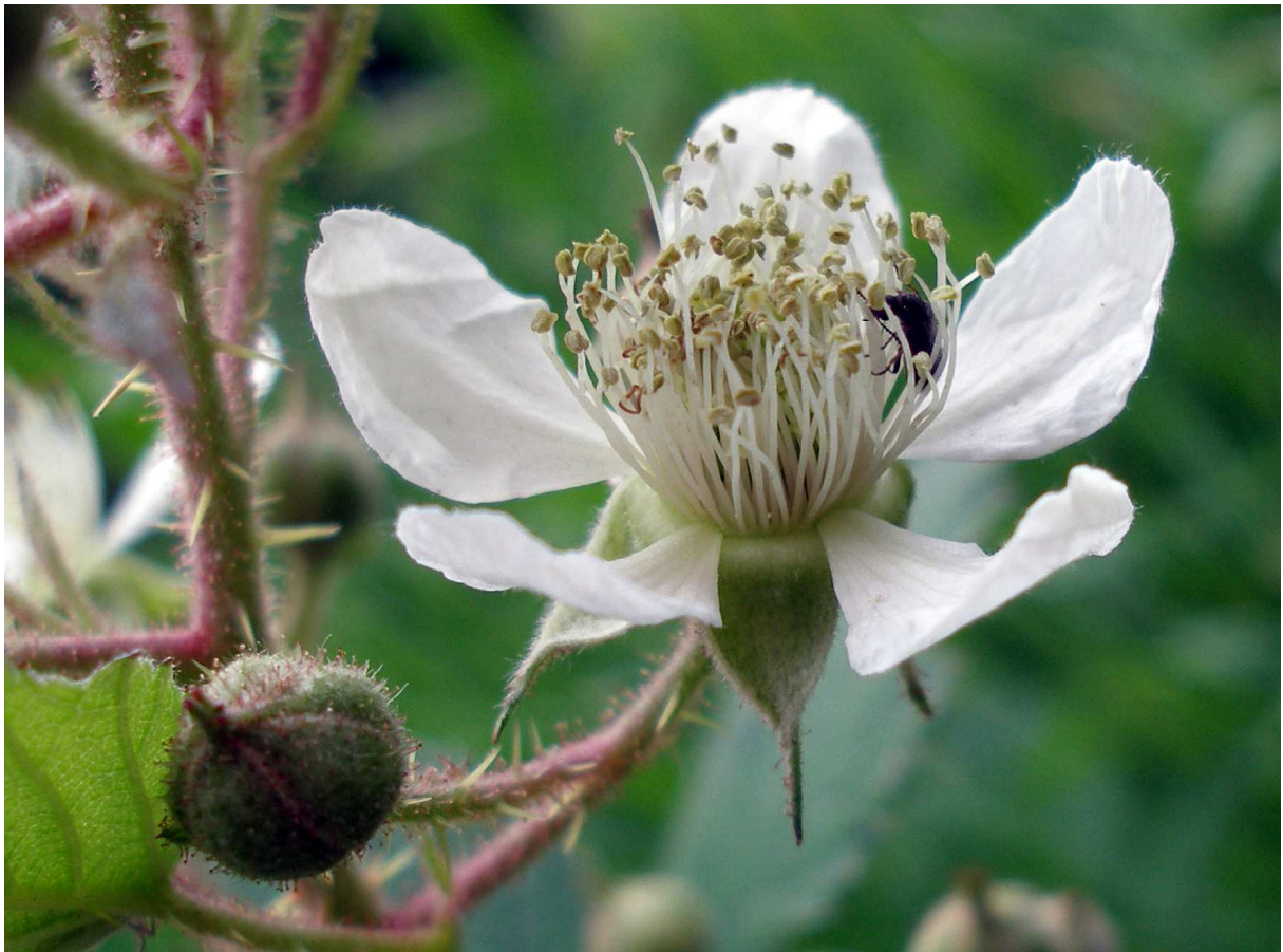
G – detail of flower (Czechia, Český Krumlov, Kuklov village, locus classicus, 48°56'08"N, 14°09'59"E, 14 VII 2009).