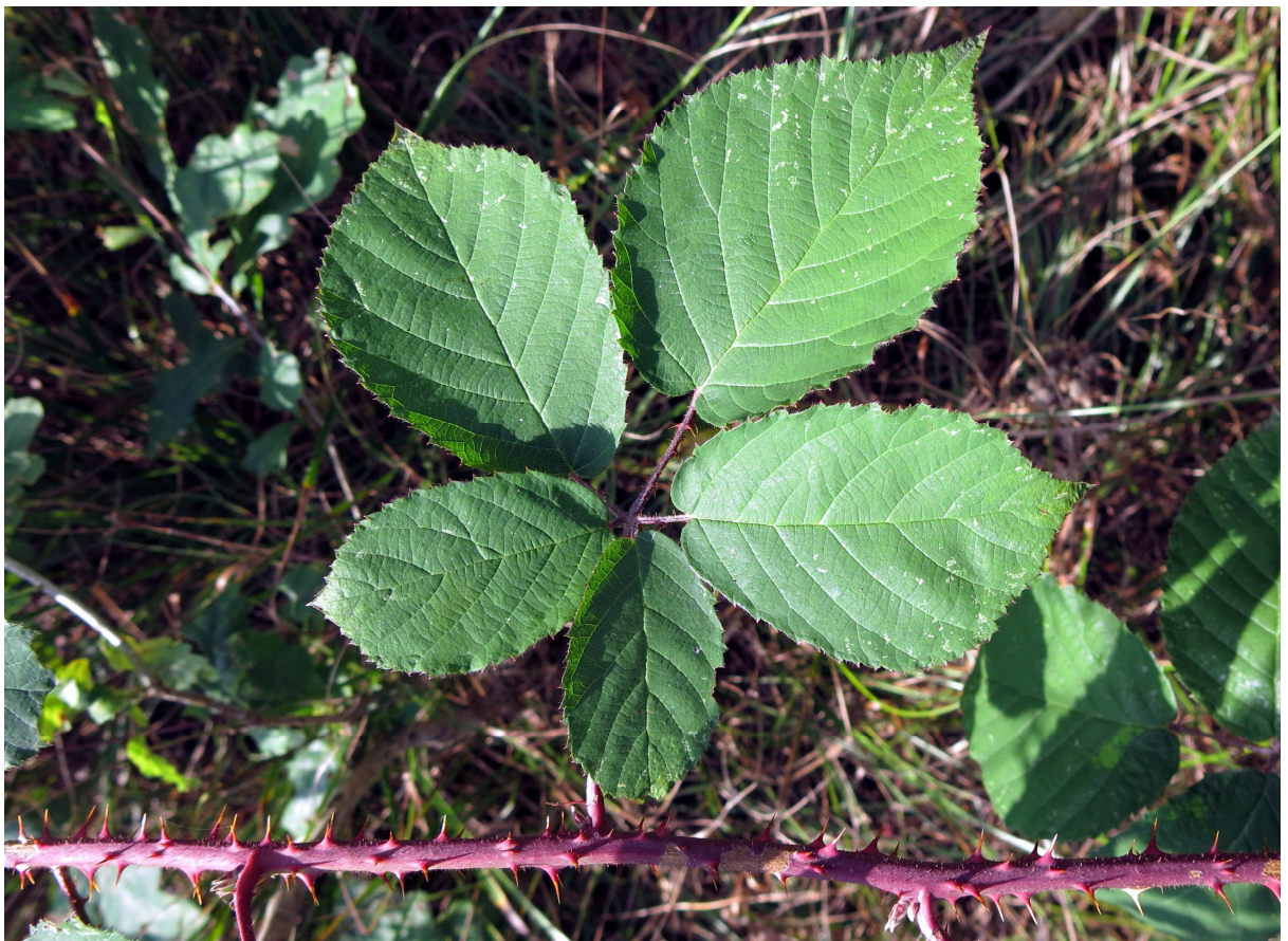
B – primocane leaf (Czechia, Strakonice district, Kladruby village, Divoš hill, 49°16'15"N, 13°45'13"E, 31 VIII 2013, photo: B. Trávníček).