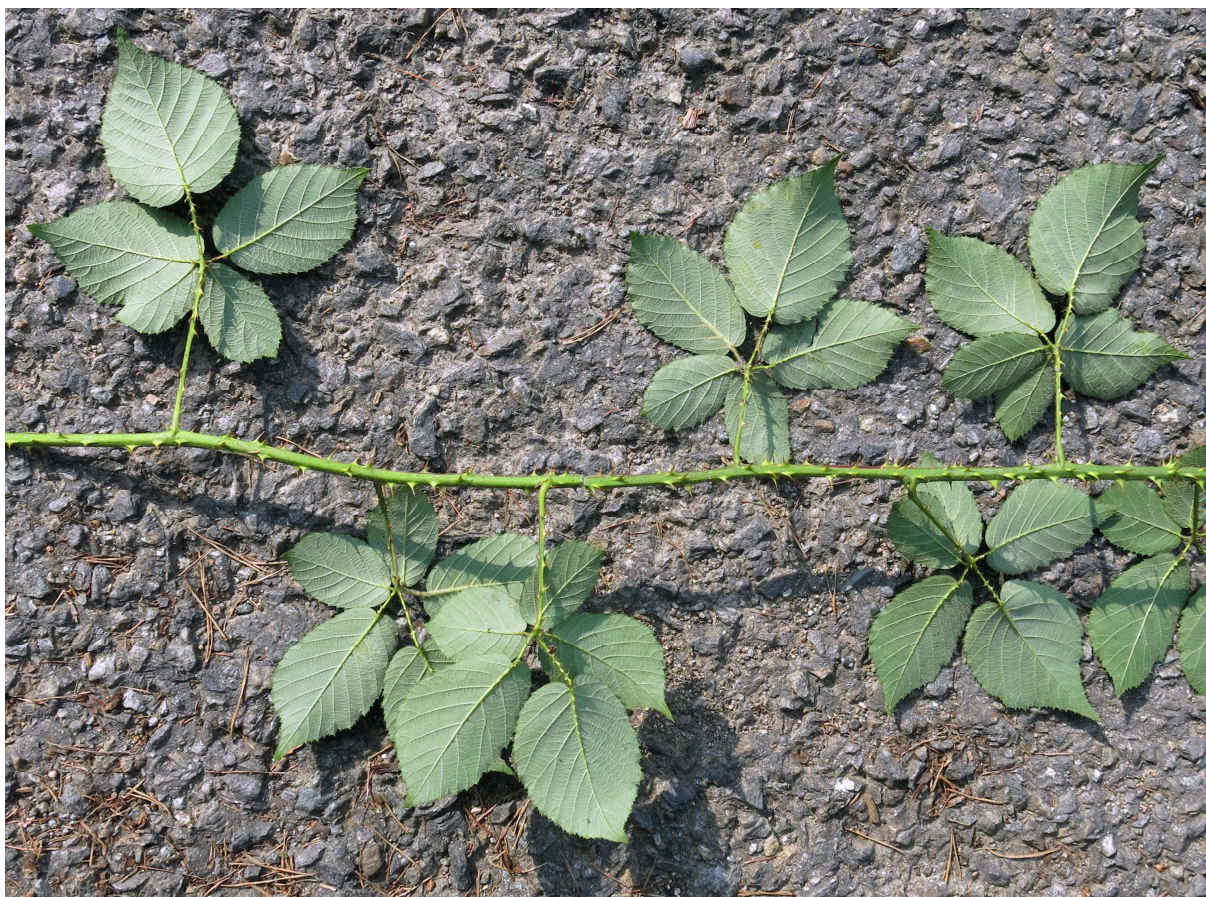
D – underside of primocane (Czechia, Strakonice district, Kladruby village, Divoš hill, 49°16'15"N, 13°45'13"E, 31 VIII 2013).