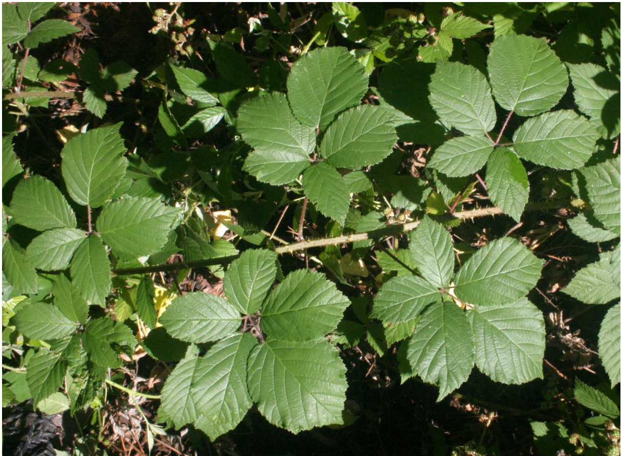
B – mature primocane (Czechia, Český Krumlov, Kuklov village, locus classicus, 48°56'08"N, 14°09'59"E, 8 VIII 2017).