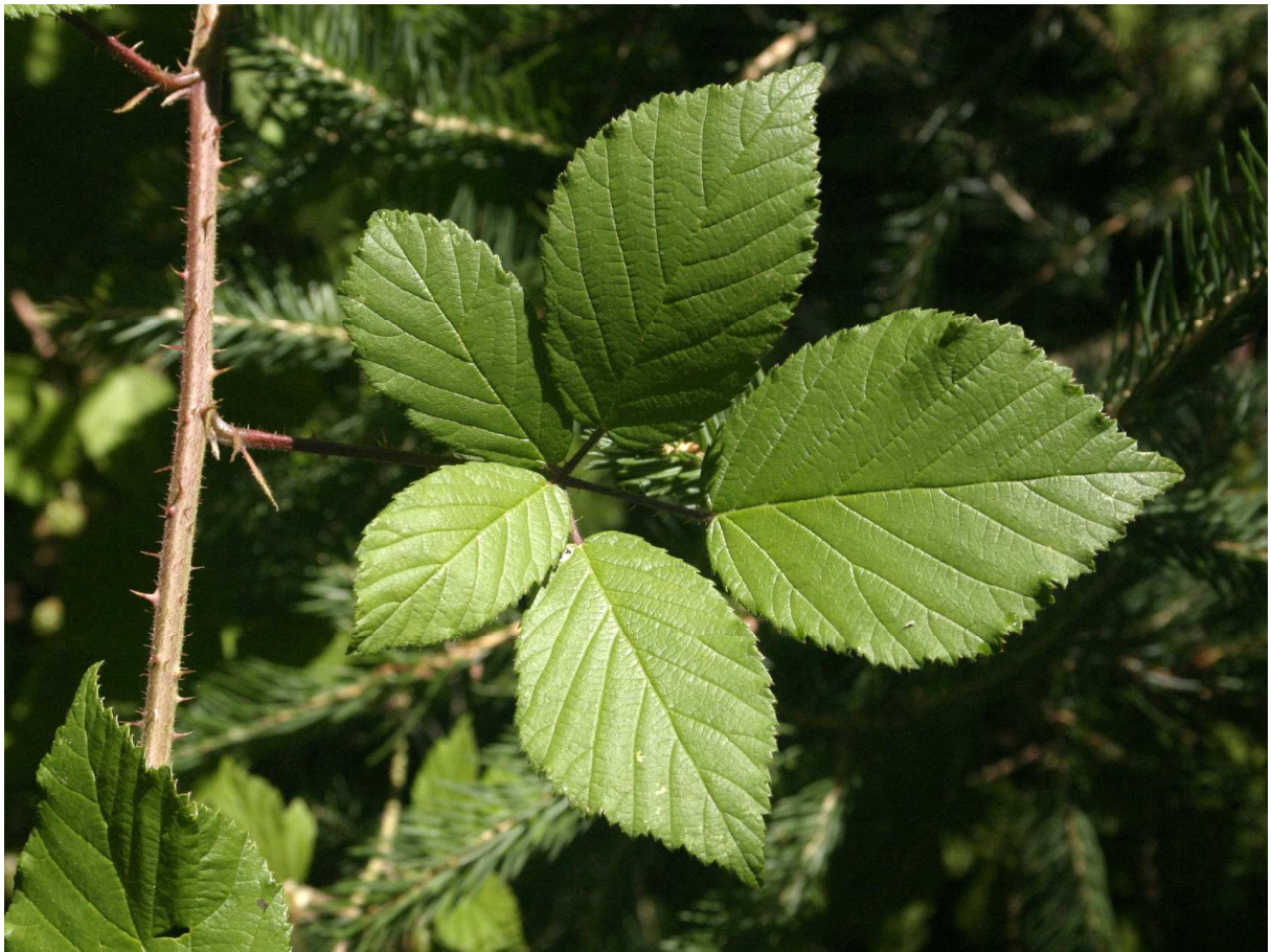
D – mature primocane leaf (Czechia, Český Krumlov, Kuklov village, locus classicus, 48°56'08"N, 14°09'59"E, 8 VIII 2017, photo: M. Lepší).