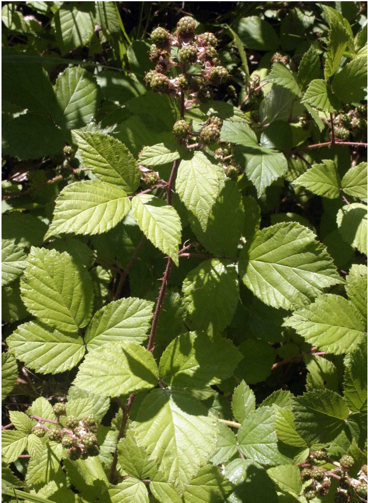
J – inflorescence from sunny place (Czechia, Český Krumlov, Kuklov village, locus classicus, 48°56'08"N, 14°09'59"E, 8 VIII 2017).