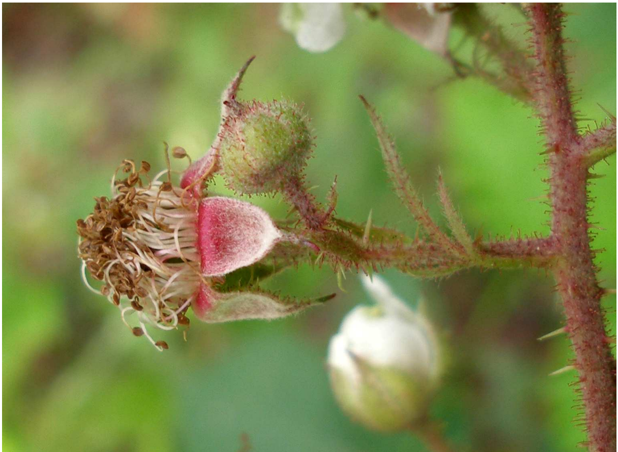
H – detail of sepals and flower bud (Czechia, Český Krumlov, Kuklov village, locus classicus, 48°56'08"N, 14°09'59"E, 14 VII 2009).