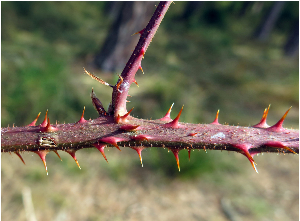
E – detail of mature primocane stem (Czechia, Strakonice district, Kladruby village, Divoš hill, 49°16'15"N, 13°45'13"E, 31 VIII 2013).