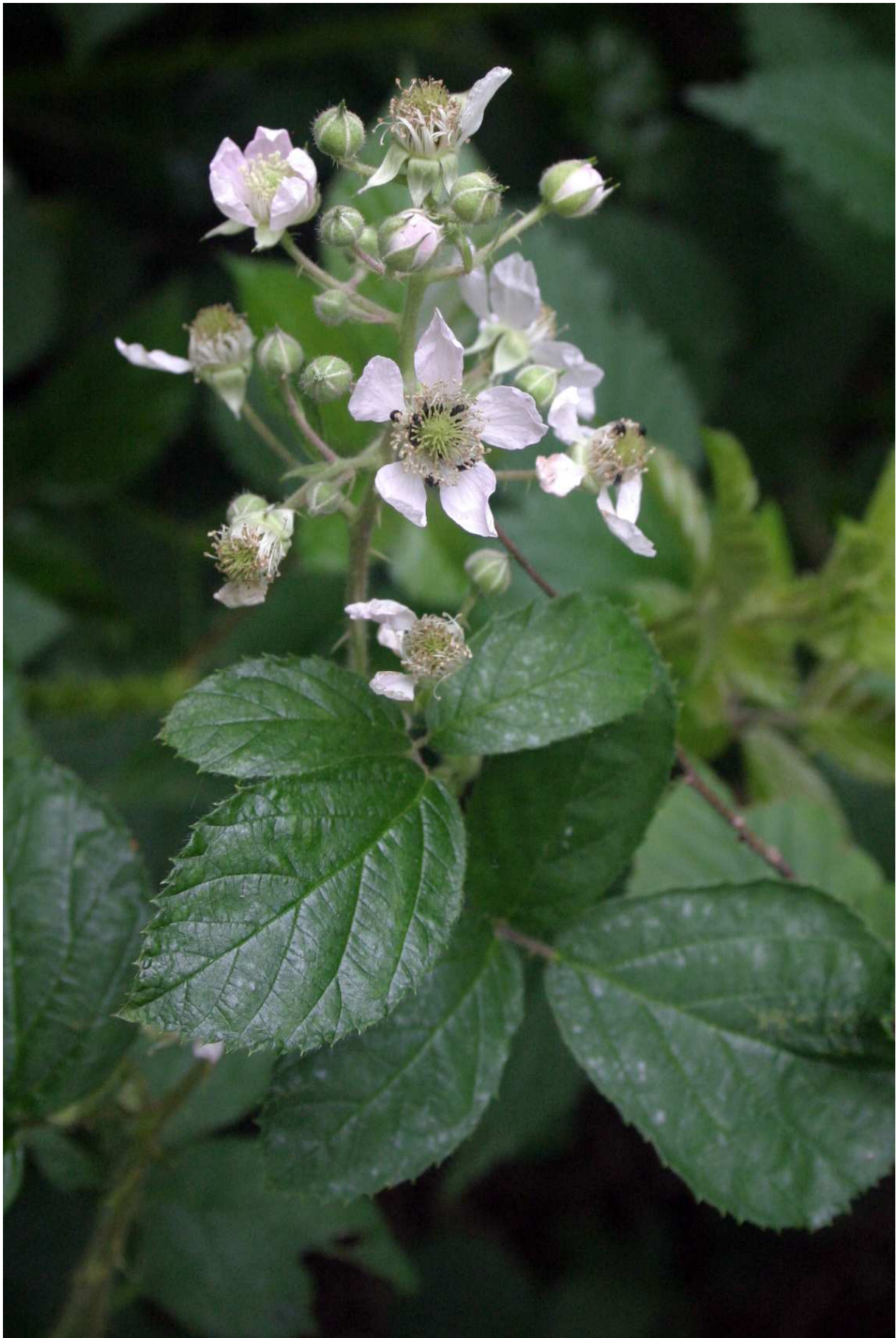
F – inflorescence (Czechia, Prachatice, Klenovice village, 48°59'16"N, 14°06'03"E, 19 VI 2018).