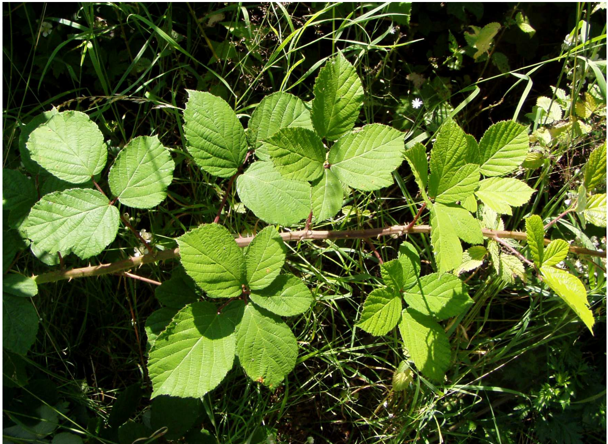
A – primocane (Czechia, Strakonice town, locus classicus, 49°14'32"N, 13°57'13"E, 9 VII 2010, photo: B. Trávníček).