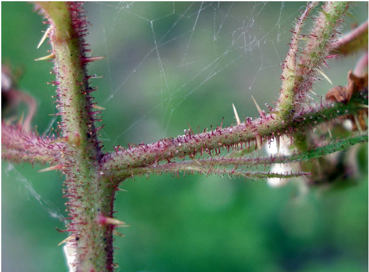
I – detail of inflorescence axis and branch (Czechia, Český Krumlov, Kuklov village, locus classicus, 48°56'08"N, 14°09'59"E, 14 VII 2009).