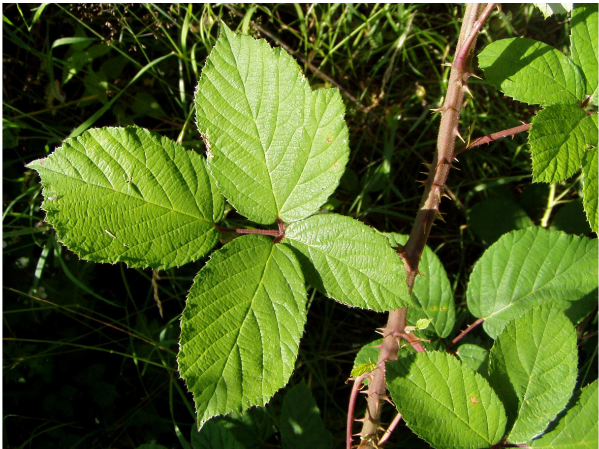
C – 4-foliolate primocane leaf (Czechia, Strakonice town, locus classicus, 49°14'32"N, 13°57'13"E, 9 VII 2010, photo: B. Trávníček).