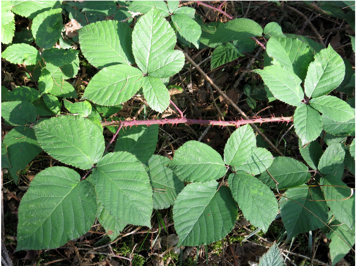
A – primocane (Czechia, Strakonice district, Kladruby village, Divoš hill, 49°16'15"N, 13°45'13"E, 31 VIII 2013).