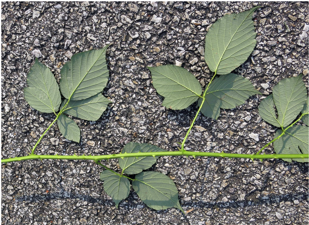
D – underside of primocane (Czechia, Strakonice district, Strakonice town, Ryšová hill, 49°16'41"N, 13°53'21"E, 31 VIII 2013).