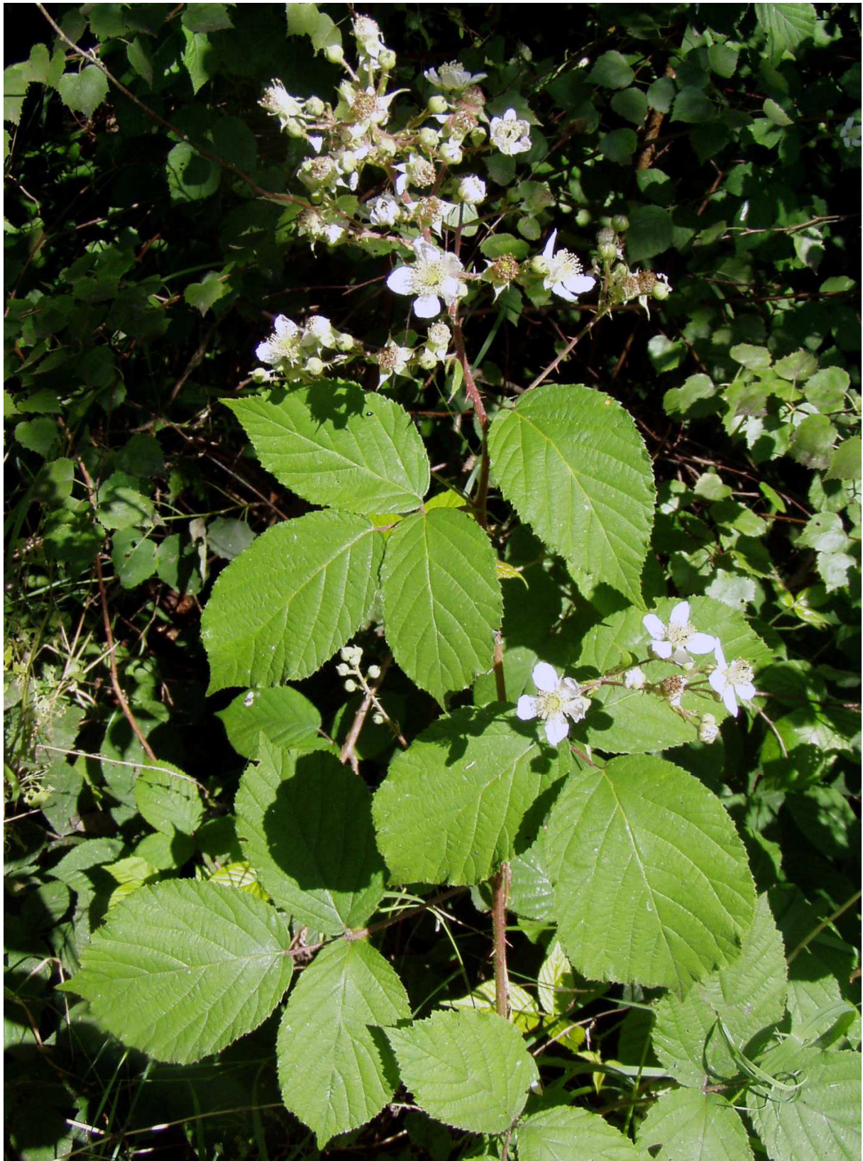
G – inflorescence (Czechia, Strakonice town, locus classicus, 49°14'32"N, 13°57'13"E, 9 VII 2010, photo: B. Trávníček).