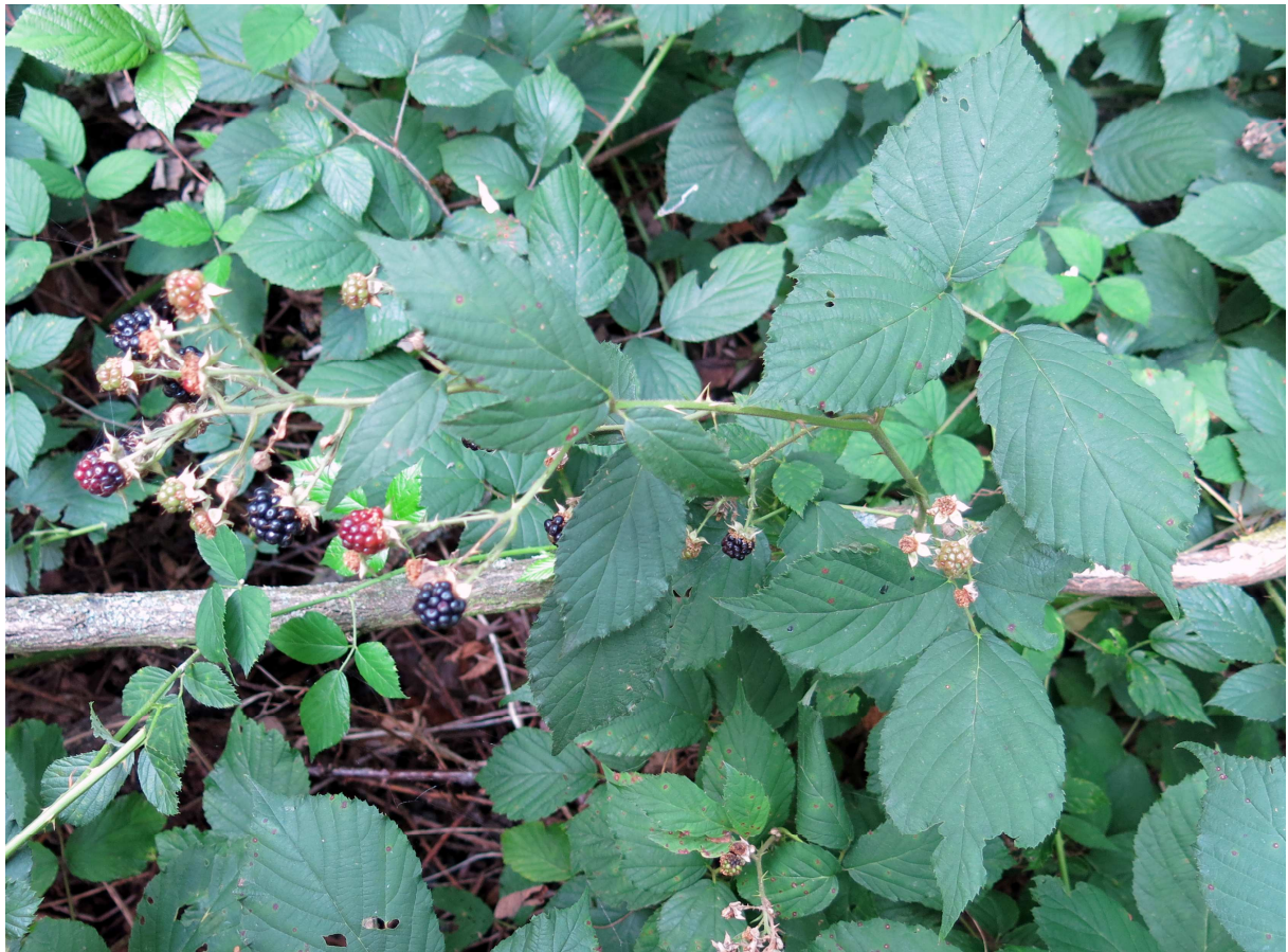
J – infructescence (Czechia, Strakonice district, Strakonice town, Ryšová hill, 49°16'41"N, 13°53'21"E, 31 VIII 2013, photo: B. Trávníček).